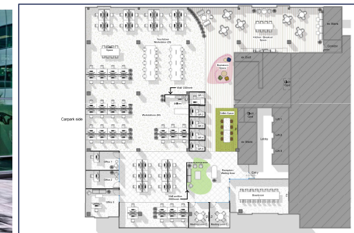
Building A, Phase 1, Level 2, Unit A. Illustrative purposes only.

Contact the team for further information or to arrange a viewing